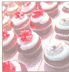
Swirlz' cupcakes will have your loved one positively swooning.

you check out this raw, organic, vegan option.